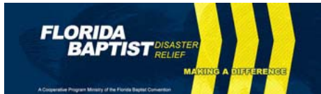
Hurricane Irma Relief Efforts