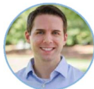
Art Rainer Best-selling author, The Money Challenge

Millennials are quickly becoming a powerful generosity force. They are actually super generous. However, it is in ways the church often doesn't receive. Learn the latest trends, best practices, and how to open the six digital giving channels that modern generations are using.