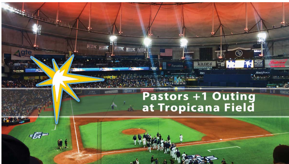
Pastors Outing at the Trop