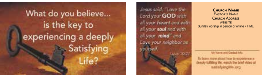
Other Conversation Cards

Visit www.all41life.org/conversing to view a variety of cards that can be used to engage in conversation. Pastors, make your selection, then can call the TBBA at 813.935.3839 to request card files featuring your church's contact information which are ready to be printed.