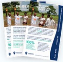
Lottie Moon Bulletin Inserts