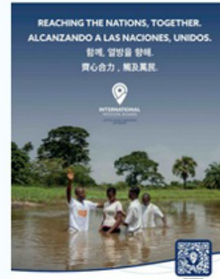
Lottie Moon Giving Goal Posters