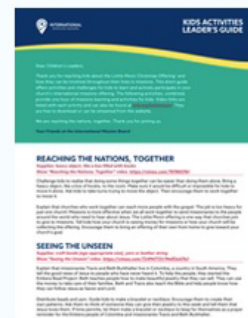
Lottie Moon Kids Activity Guides

(click here or on the link below for week of prayer)