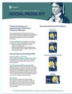
Lottie Moon Social Media Graphics