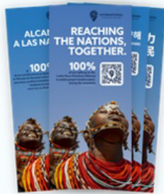
Lottie Moon Banner Graphics