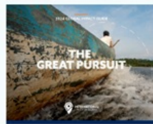
Global Impact Guides 2024