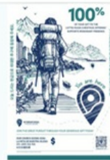
Church Giving Goal Posters