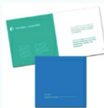
Social Media Resources

Get your Lottie Moon Resources and connect to the online prayer guide at https://www.imb.org/generosity/resources/